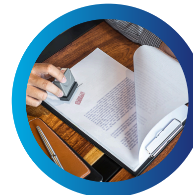
Change of use guidance