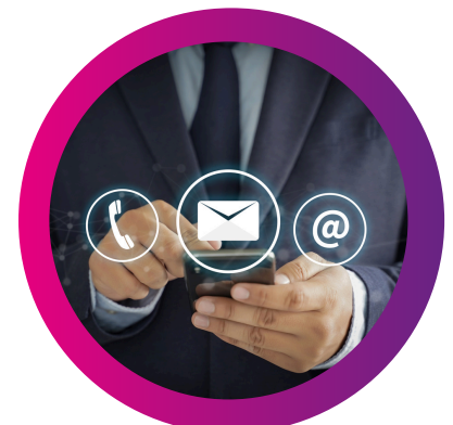
Contact planning with an enquiry