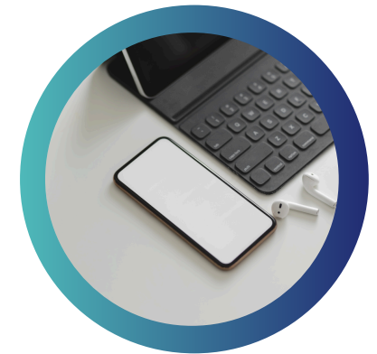
Apply & pay for planning permission online