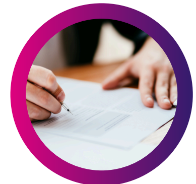
Business rate reductions