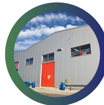
Empty property relief for businesses (including land)