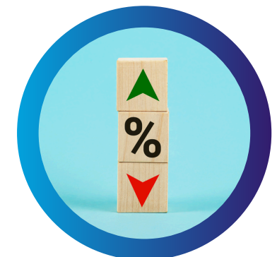
Small business bonus information