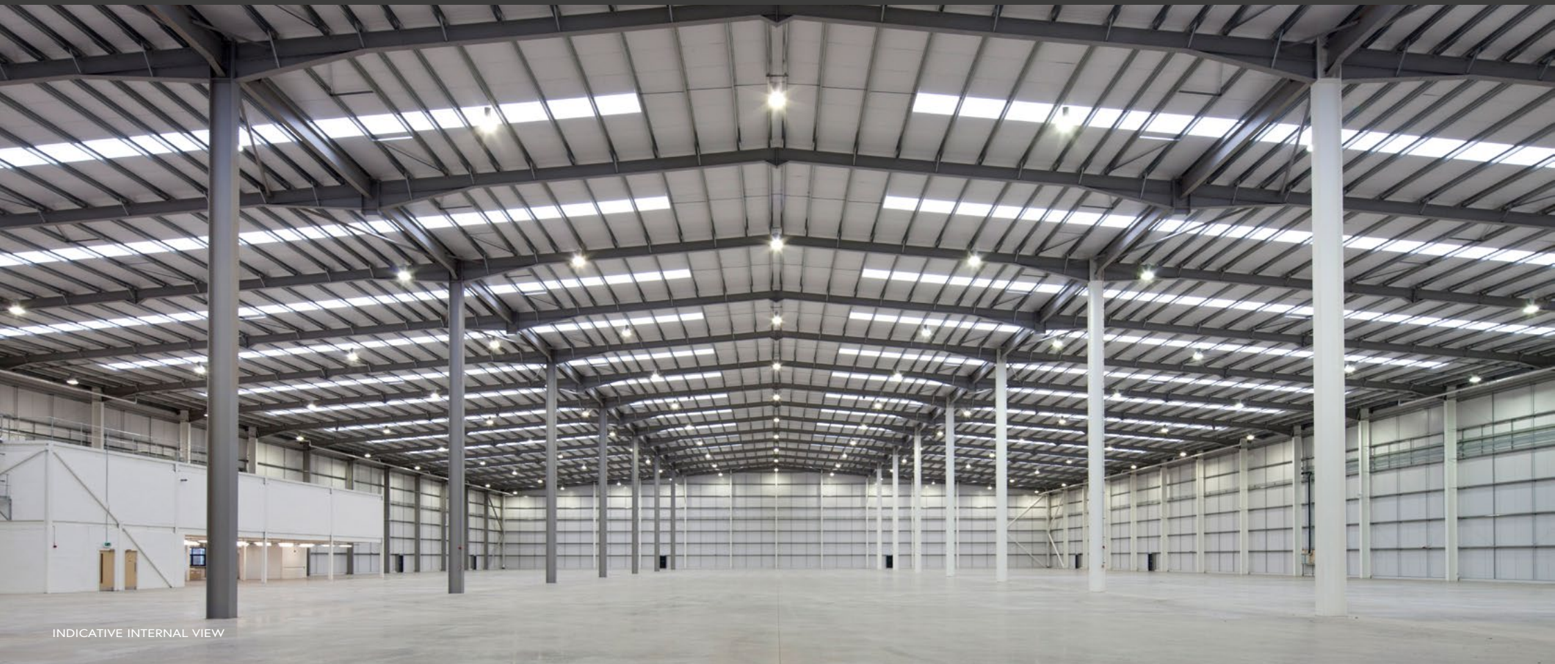
INDICATIVE INTERNAL VIEW